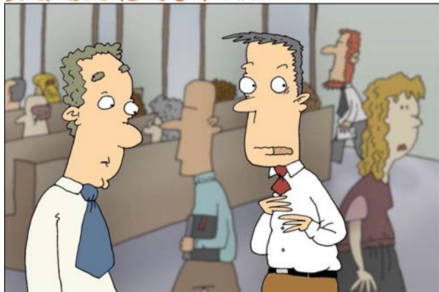
I TOTALLY MISUNDERSTOOD THE CONCEPT OF THE 10 PERCENT TITHE