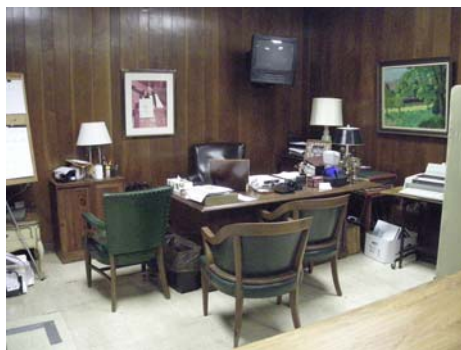
The “open classroom” temporary offices for our rector and administrator

Later this month, a work day will paint some of these new spaces, as