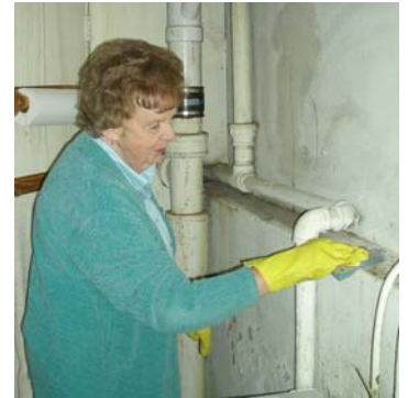
No idle hands or Devil's workshop here!

and with this we expect there will be no direct cost to the parish for these changes. The costs for renovation can only be kept within budget if we have sufficient volunteer help with simple tasks, like painting, organizing, cleaning, and even gardening if the weather holds. We are planning a parish work day for this purpose on Saturday, October 17, from 8:30 to 12:30. Please sign up if you are able to come, so we can plan accordingly. Your parish family needs your help! ✕