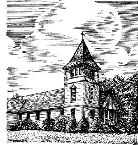
Church of the Annunciation Oradell, New Jersey

343 Kinderkamack Road at Center Street www.annunciationoradell.org 201-262-7222