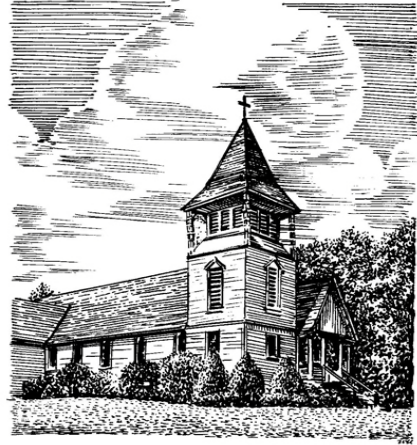
Church of the Annunciation Oradell, New Jersey